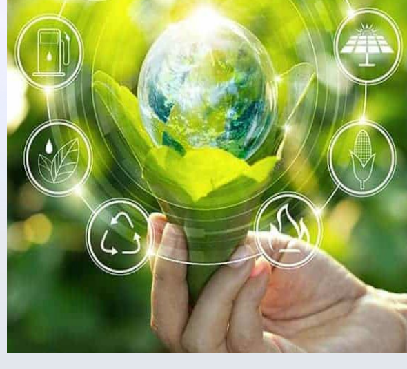
4. Sustainability Energy monitoring to reduce waste and carbon footprint

Prolonged equipment life through data-driven decisions