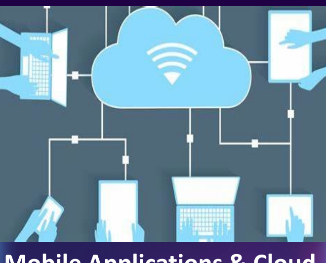
Mobile Applications & Cloud Platforms

Benefits: Reduced costs, minimized breakdowns, extended asset life.