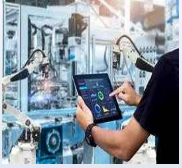
3. Enhanced Asset Lifecycle Management

Prolonged equipment life through data-driven decisions