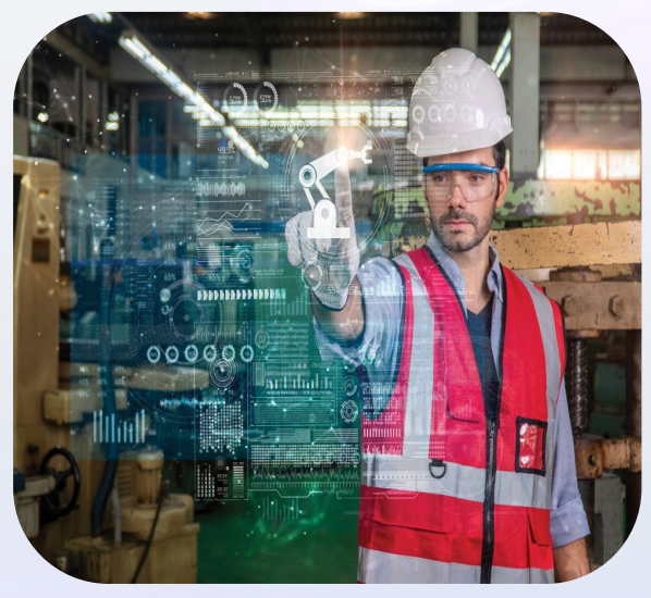
2. Improved Safety & Compliance

Real-time alerts and accurate documentation.